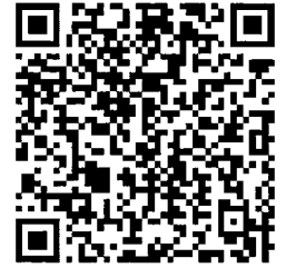
2025-2026 Proposed Budget